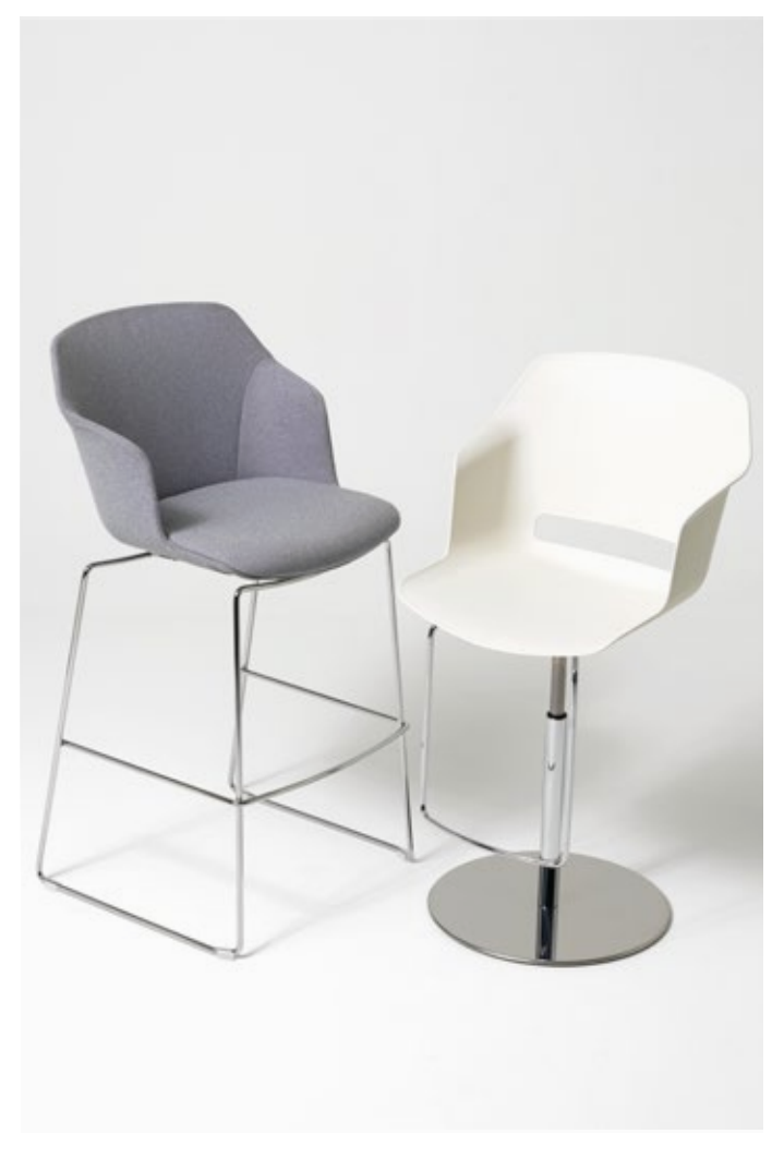
Jet 9804 / White