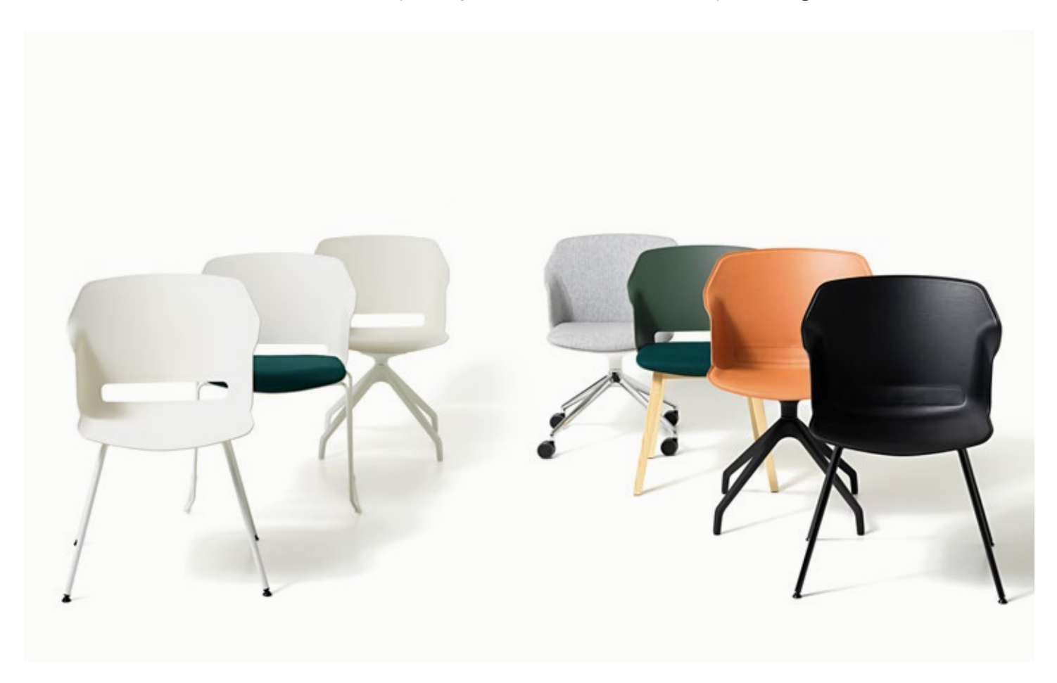
White / White - Bingo 496 / Wolin 7050.22 / Green - Bingo 496 / Natural Leather / Black Leather

In its visitor version, CLOP easily accompanies other furnishings thanks to its rich possibilities of personalisation. Designed by DorigoDesign, Clop stands out for its clean lines and for its enveloping shell back. Its vintage design combines with a contemporary attitude to make Clop an ergonomic choice.