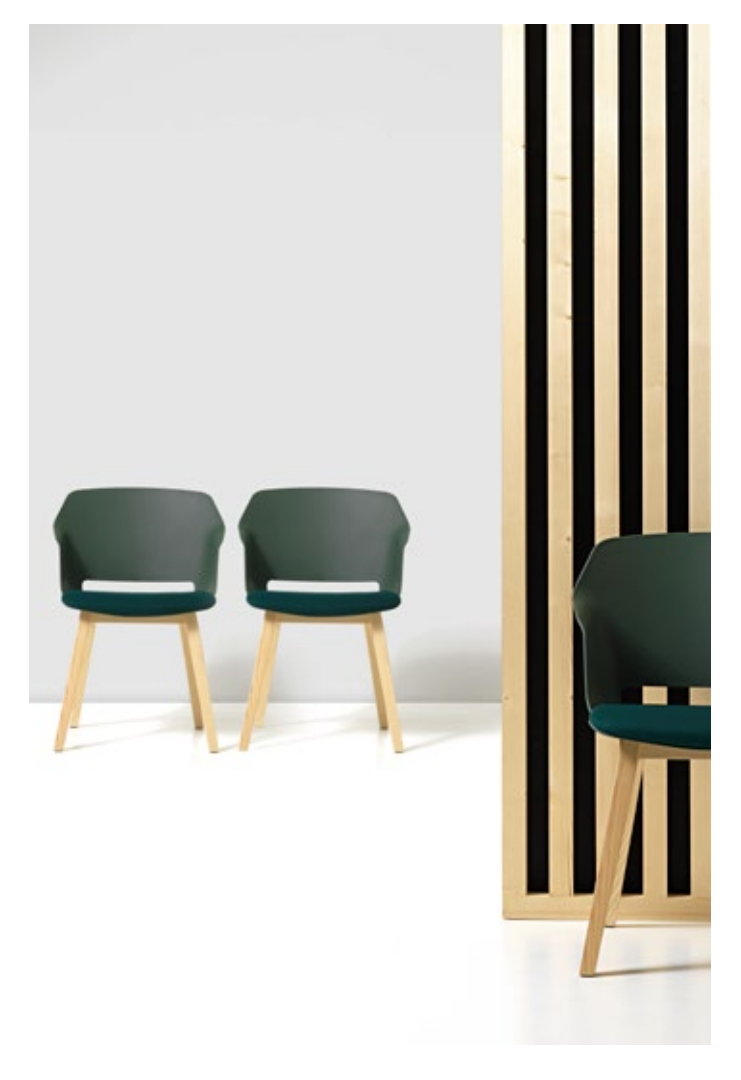
Green - Bingo 496