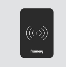
Wireless charger Charge your phone fast and wire-free inside our pods! The charger itself is located underneath the table, with a sticker on top of the table indicating where to place your phone to get it charged.