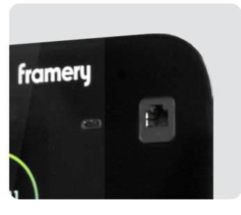
LAN Port It is possible to add a LAN Port to the UI Panel. This option includes a LAN cable.