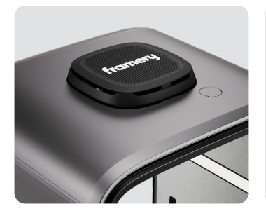
Activated carbon filter Keep the air inside Framery One extra fresh and clean and free of odors with an activated carbon filter. The filter removes pollutants from the air with an adsorption process.

Occupancy light Stepping into the pod, Framery One's occupancy lights will display a red light with 360° visibility to let the office know the pod is in use.