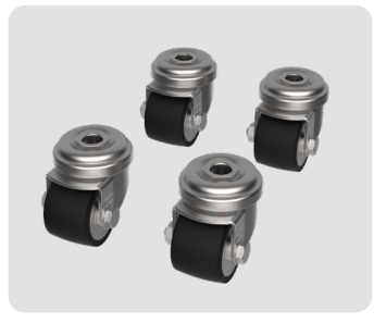
Movability kit Framery One can be easily relocated without disassembly by lifting the levelling feet up and thus lowering the pod onto its wheels. The high load capacity polyurethane castor wheels are both durable and pliable. Number of wheels: 4.