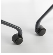
Castors / XK Hard or soft castors.