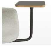
Writing pad / XK