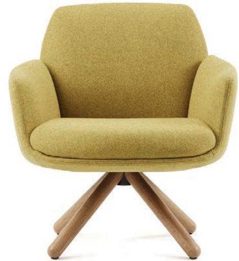
Wooden Dowel Base Full-swivel with optional self-centering and the warmth of wood