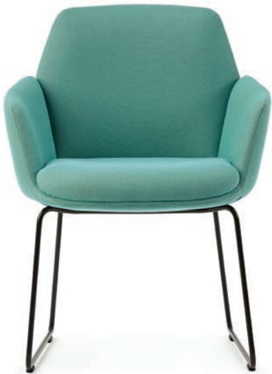
Sled Base Sleek, minimalistic aesthetic