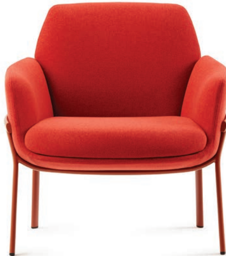
Basket Base Light, modern look